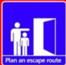
Plan an escape route

If there is a fire in your home, it will be much easier for you to escape if you have already thought about the best way to get out.