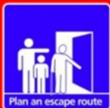
Plan an escape route

If there are children, older or disabled people or pets, plan how you will get them out.