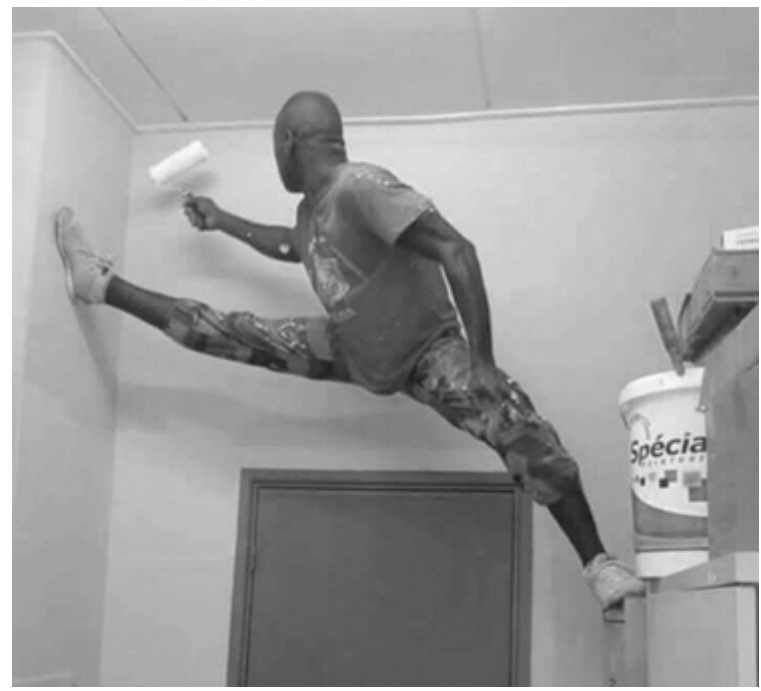
What is wrong in this picture?

There is a man who is trying to complete his task with an uncomfortable body position, he is just about to suffer a cramp or tear due to the bad position of his body and the extreme stretching that he is doing with his legs and as a consequence he is about to suffer a fall. It is important to consider the hazards created when utilizing subcontractors and what can be done to mitigate the hazards.